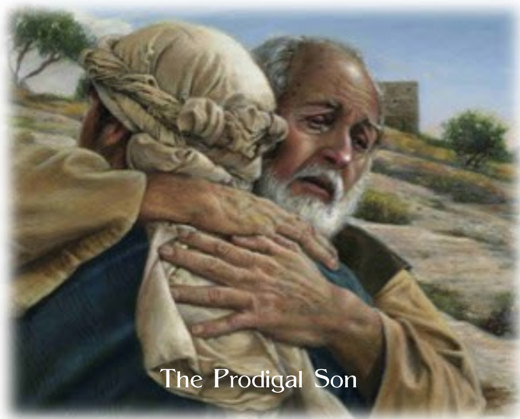
The Prodigal Son