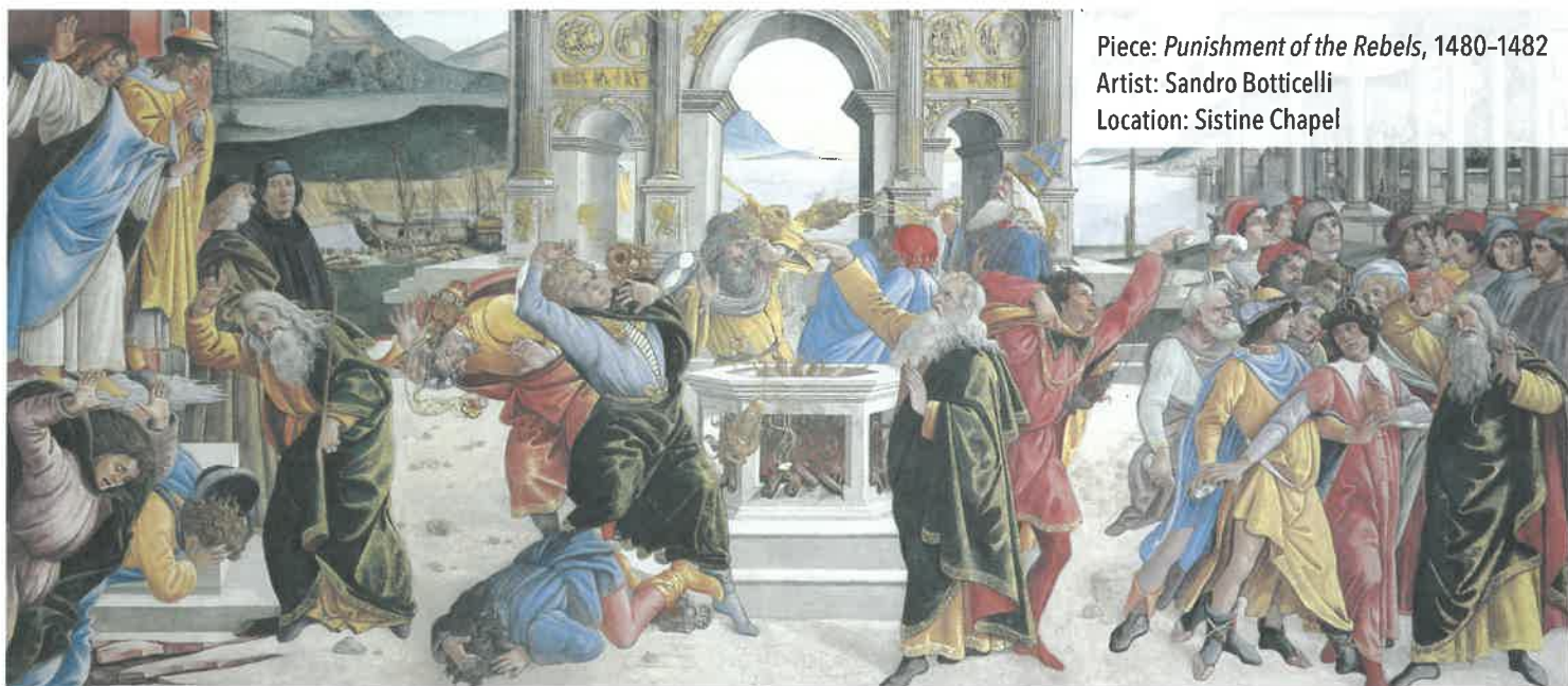
Piece: Punishment of the Rebels , 1480–1482

Is there anything I should adjust in my lifestyle to be better prepared for my definitive encounter with God?