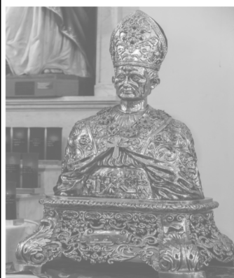
The Shrine Church of The Most Precious Blood is The National Shrine of San Gennaro