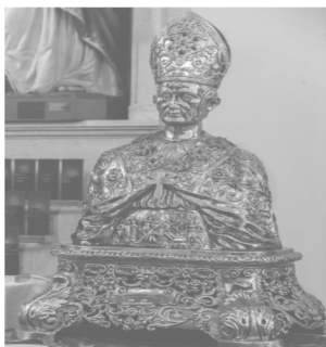
The Shrine Church of The Most Precious Blood is The National Shrine of San Gennaro