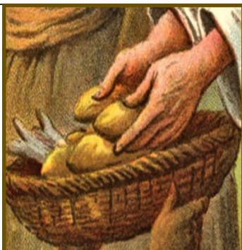
He fed the 5000 with 5 loaves and 2 fish.