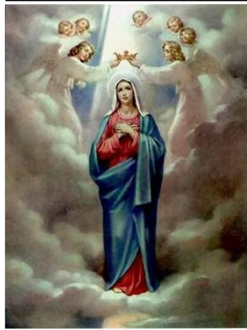
The Assumption of the Blessed Virgin Mary Thursday, Aug. 15 Masses 8:30am & 7:15pm