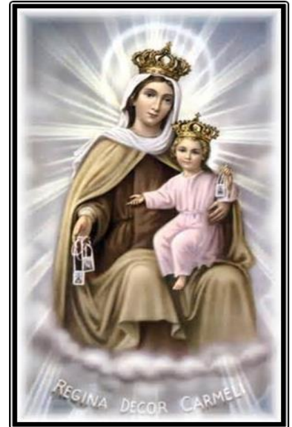
“Queen and Beauty of Carmel”

Look us up on our website: www.olmcwharton.org