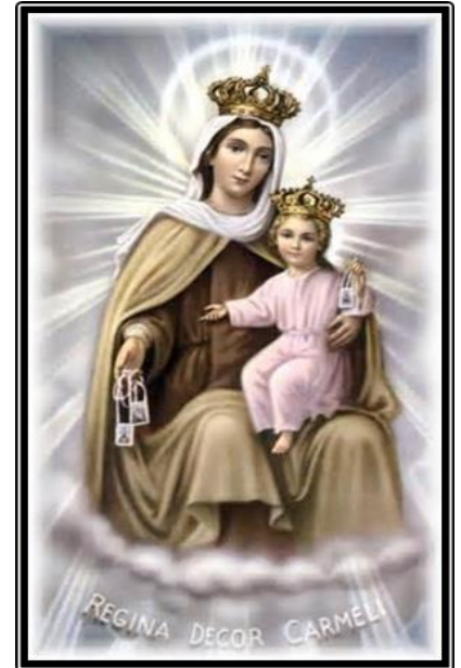
Queen and Beauty of Carmel

Look us up on our website: www.olmcwharton.org