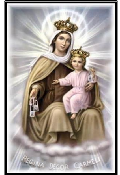
Queen and Beauty of Carmel

Look us up on our website: www.olmcwharton.org