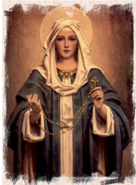
Our Lady of the Rosary Patroness of the Diocese of Victoria