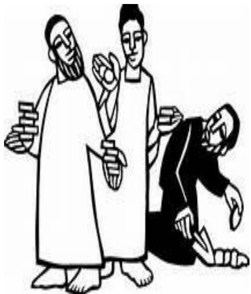
Parable of the Talents

Thirty-Third Sunday in Ordinary Time Trigesimo Tercer Domingo del Tiempo Ordinario