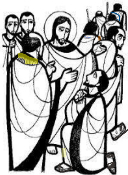
Simon Peter confesses his Faith. That Jesus is the Holy One of God

AUGUST 22, 2021 The Twenty-first Sunday In Ordinary Time Vigésimo Primer Domingo del Tiempo Ordinario