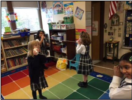
The first graders had a lot of fun investigating sound. They learned about sound waves and how they can travel through objects. They also worked together to design and build their own instruments.