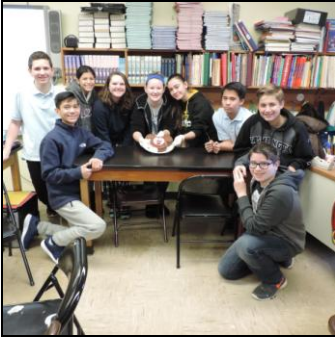
Grade 8 celebrating science mid-terms with Mickey Mouse.