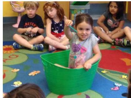
The first day the children went fishing.