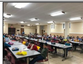
Second grade students at their retreat.

NEXT MEETING: Wednesday, February 7 th at 7pm in the Church beginning with the Rosary