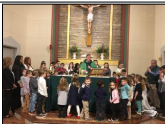
Father Owen celebrating Mass with the ECC and religious education children for Catholic Schools week