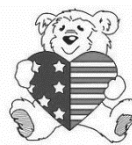
Hope for Haiti

Dear Parents and Parishioners, This year our CCD project is again to help the people of Haiti. This year we would like to assist with several of the programs needed by the Haitian Health Foundation.