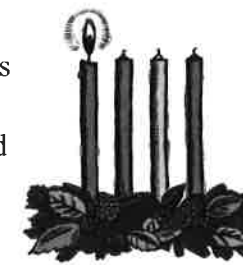
First Sunday in Advent