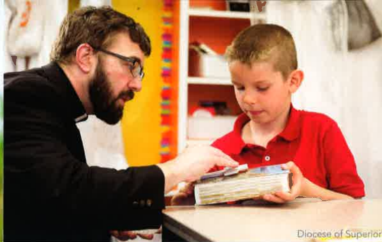
Diocese of Superior

The growing clergy shortage means that priestly presence is waning in many Catholic institutions, especially high schools and colleges. Even Vocation Directors, whose job is to help young people discern God’s call, often find themselves with one or two (or more!) additional assignments. More than ever, the Church needs lay people, especially families, to encourage the next generation of vocations.