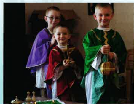
Kids playing Mass at home has an added benefit: they often pay more attention at church! A variety of children’s Mass kits are available at sites like www.agnusdei.us .

Children have pretended to celebrate Mass for literally centuries, and why not? It’s a way of emulating one’s heroes. Think of the third-grader in a Tom Brady jersey throwing a football, or the son of a police officer driving a toy cruiser.