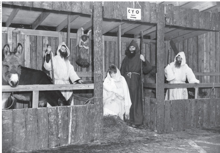
This undated photo shows youths from the parish CYO depicting the Nativity.

The parish will stay busy in 2011. If enough funds are raised, ground will be broken next summer for the approximately $4.1-million, 10,000-square-foot Parish Life Center. A multipurpose facility to be built on the north parking lot, it will feature a large gathering space, kitchen, classroom area and a gymnasium that will give the parish CYO teams a real home court for the first time.