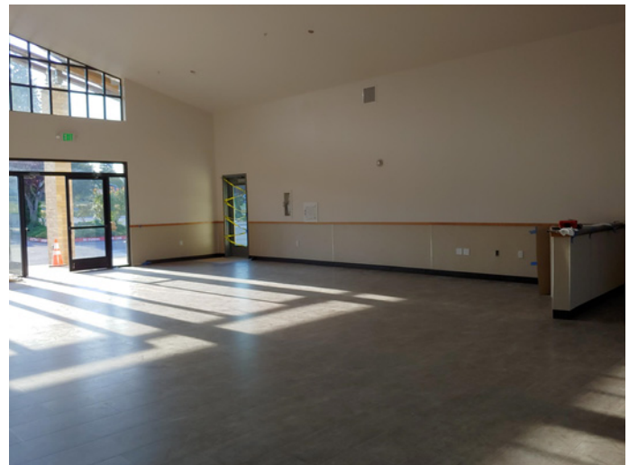
View of the front doors from the new narthex .

Dedication of the new building—September 29th after the 10:30 mass.