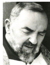
St. Padre Pio