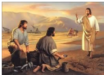
The call of Peter and Andrew