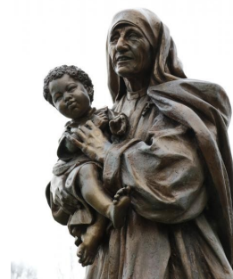
A statue of Blessed Teresa of Kolkata holding a child is seen in a prayer garden at Cure of Ars Church in Merrick, N.Y.

With the world filled with so much darkness, St. Mother Teresa of Kolkata will surely be continually absent from heaven.