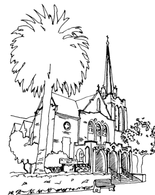
St. Thomas Aquinas Church

Watch for sign-up sheets after Mass to volunteer to help with set up and clean up.