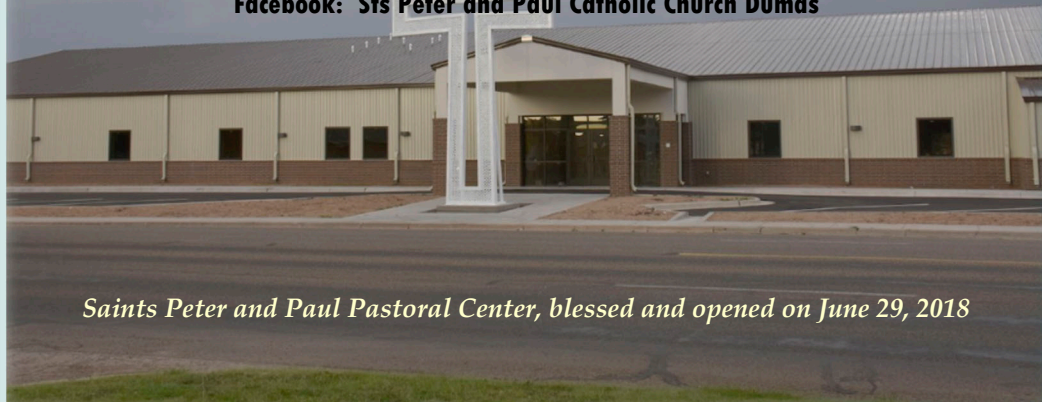
Saints Peter and Paul Pastoral Center, blessed and opened on June 29, 2018

Facebook: Sts Peter and Paul Catholic Church Dumas