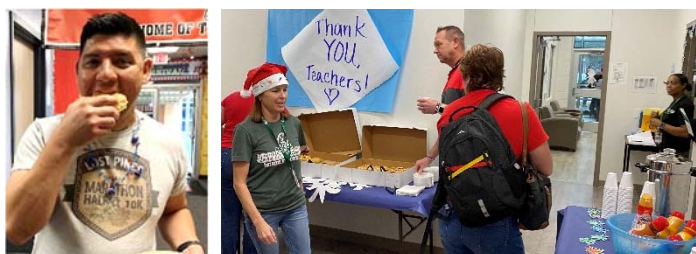
December 16, 2021. And FPC provided breakfast kolaches for SFA Middle School faculty and staff as well!