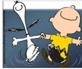
What if today, we were just grateful for everything?

On Saturday, Dec. 8th, the Feast Day of the Immaculate Conception, is a Holy Day of Obligation. There will be a 9:00am Mass in English and a 6:30pm Mass in Spanish. The vigil Mass that fulfills your Sunday obligation will be at 4:30pm as usual.