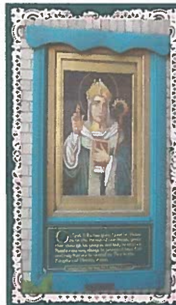
St Finbar (Barry) Bishop

Eternal Father, You have made St Finbar an exemplar of divine love and the faith that conquers the world, and added him to the roll of saintly pastors. Grant by his intercession that we may persevere in faith and love and become sharers of his glory. Amen.