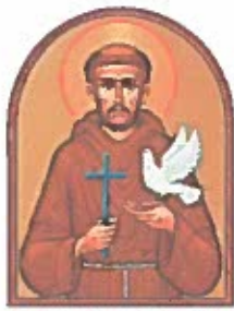
SAINT FRANCIS OF ASSISI

Sunday: 8:30am & 10:00am in English; 11:30am in Spanish