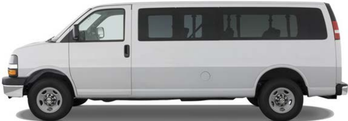
Side view of an extended van – Not Allowed