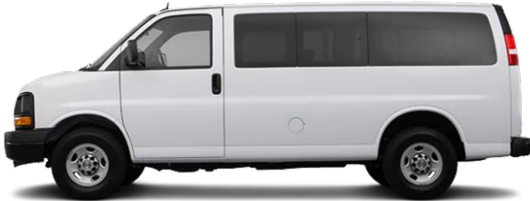
Side view of a long wheel base van – Allowed