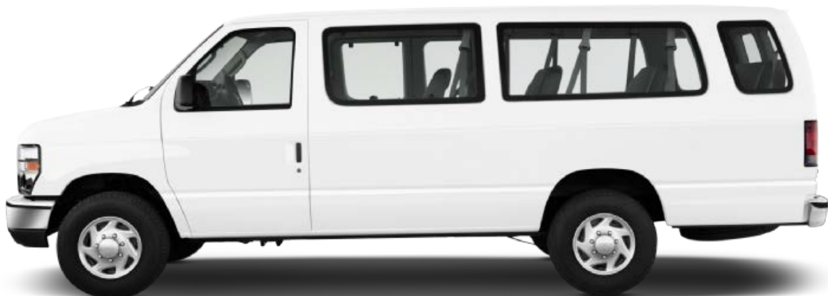
Side view of an early model extended van – Not Allowed