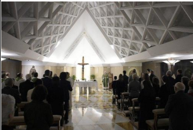
Pope Francis celebrates Mass at the Casa Santa Marta

VATICAN CITY (CNS) "Be watchful, every day, so that you don't end up far from the Lord." That was the invitation of Pope Francis during his homily at the morning Mass at Casa Santa Marta on Thursday. The Pope spoke of the risk, to which we are all exposed, of weakness of the heart.