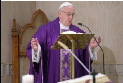
Pope Francis at Casa Santa Marta

When fasting, Pope Francis said, a true Christian must be consistent, not putting himself on show, never despising others or engaging in quarrels or disagreements.