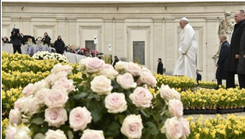
Pope Francis concludes the cycle of catecheses on the Mass at the General Audience on Easter Wednesday.

Wednesday's catechesis focused on the concluding rites of the Mass,