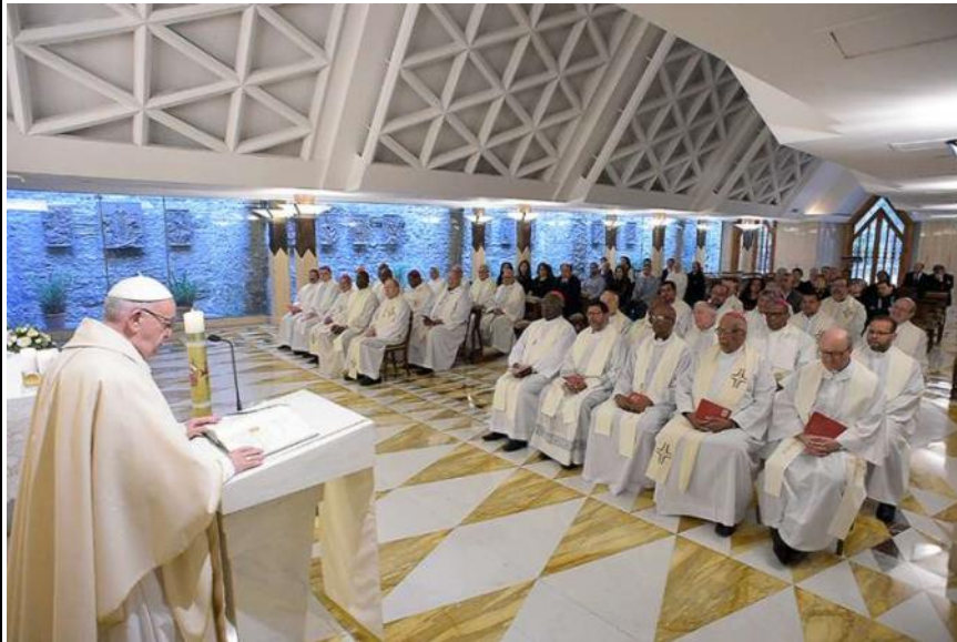
Pope Francis celebrates Mass at Casa Santa Marta on April 26, 2018.

The first lesson is the commandment of love, which is exemplified in