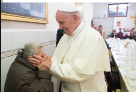
Pope Francis shares a meal with poor people at a soup kitchen.

In a message released on Thursday for the 2nd World Day of the Poor, celebrated this year on November 18, Pope Francis said we live in a world “which praises, follows and imitates those who have power and riches, while at the same time marginalizing the poor and considering them an object of shame.”