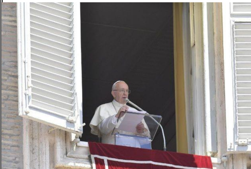
Speaking before the recitation of the Angelus on the Solemnity of Saints Peter and Paul, patrons of Rome, Pope Francis reflects on Jesus' dialogue with Peter and the disciples regarding His identity.

Pope Francis said that this Gospel episode is "fundamental for our journey of faith" because it demonstrates a crucial dialogue between Jesus and his disciples. With the first question, "Who do others say the Son of Man is"? (Mt 16:13), Jesus "seems to be