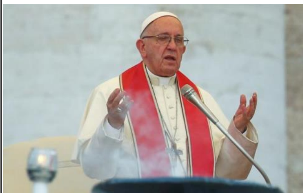
Pope Francis has decreed that capital punishment constitutes an 'attack' on the dignity of human beings.

Last year, 53 sovereign countries issued death sentences and 23 executed at least 993 people, according to Amnesty International. Most executions took place in China, Iran, Saudi Arabia, Iraq and Pakistan.