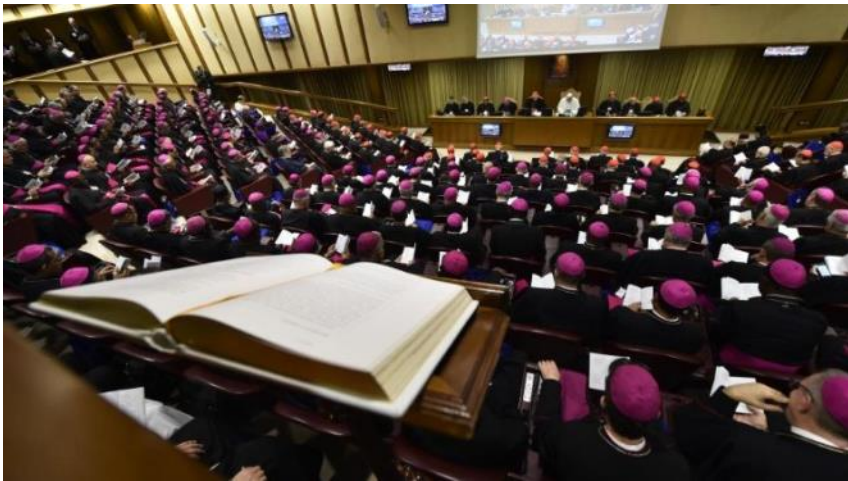
Pope Francis with Bishops and Cardinals at the Synod

The phenomenon of the abuse of minors, the horrific experiences of the victims, the procedures to be applied in the face of accusations, and the indications to ensure a safe environment for children and young people, will thus be examined from a perspec-