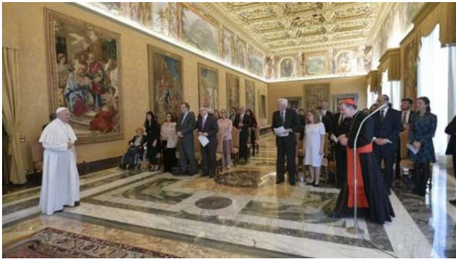
Pope meets Jewish American Committee

(Vatican News) Pope Francis on Friday marked International Women's Day, stressing the "irreplaceable contribution of women in building a