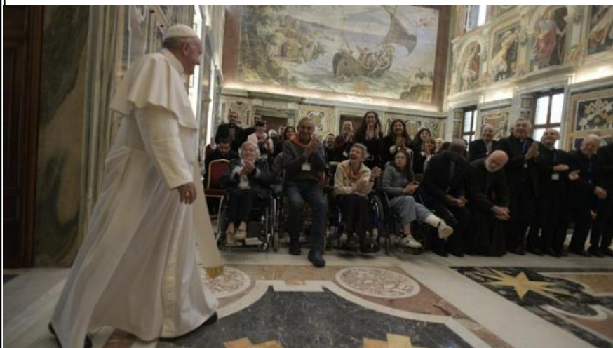
Pope Francis meets the Italian Catholic Association of Healthcare Workers on the occasion of the 40th anniversary of its foundation.

(Vatican News) At the core of the Pope’s discourse to members of the Association was the defense, respect and promotion of life. Conscientious objection The practice of conscientious objection, the Pontiff stressed, in ex-