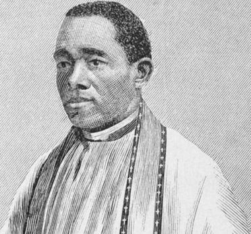
Father Augustus Tolton, a US slave who became the first African-American to become a Catholic priest, served for a time in what is now the Diocese of Jefferson City. He died in 1897. Pope Francis made Father Augustus Tolton "Venerable" within the church, in a Vatican announcement on Wednesday.