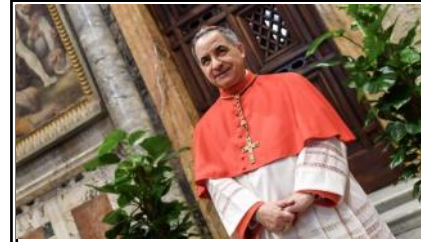
Pope Francis receives in audience Cardinal Angelo Becciu, Prefect of the Congregation for the Causes of Saints, and authorizes the promulgation of decrees regarding eight causes for canonization.