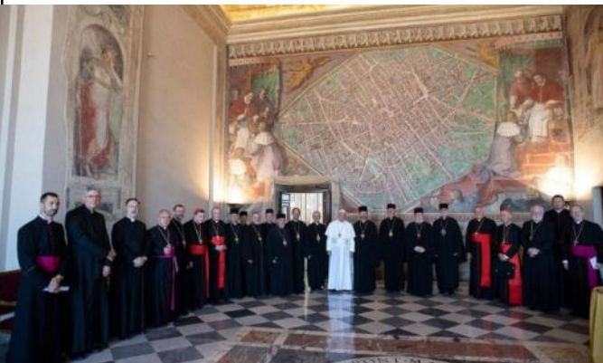
Pope Francis with the leaders of the Ukrainian Greek-Catholic Church

"It may be said that I begin and end the days 'in Ukrainian', looking at Our Lady," the Holy Father said, ensuring the Bishops that he entrusted them and their churches to "the tenderness of Our Lady, who is Mother."