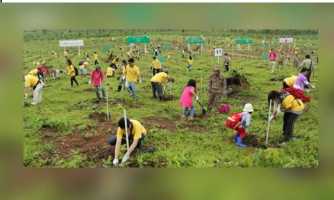
A tree-planting event in Yangon, Myanmar.

VATICAN CITY (CNS) More than 200 Catholic Church workers and young people joined in a tree-planting event last week in Myanmar, in a show of responsibility for protecting the environment in the spirit of the Pope Francis Encyclical, "Laudato Si".