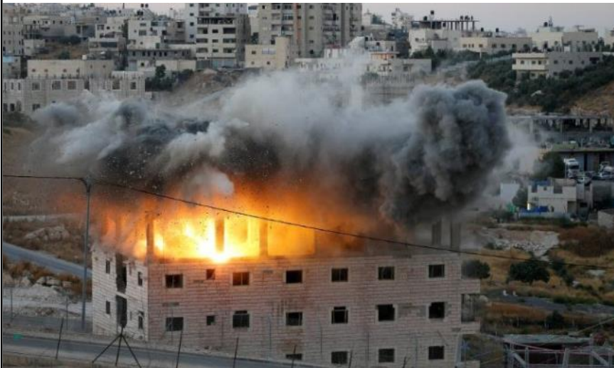
Holy See says that the Israeli-Palestinian problem has repercussions in the wider Middle East