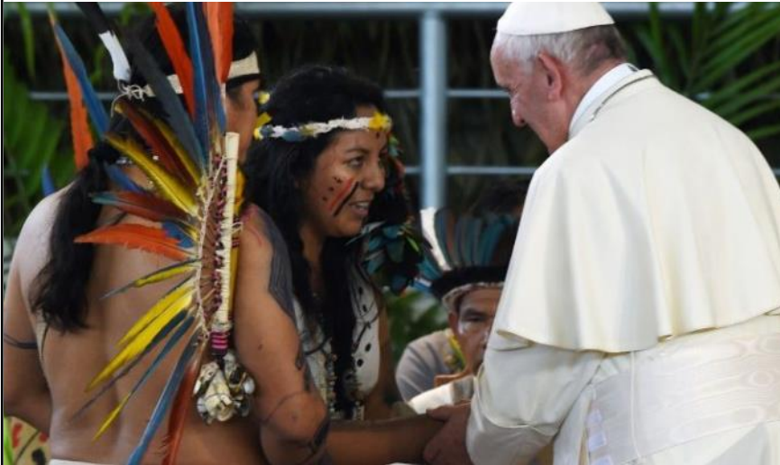
Pope Francis greets representatives of indigenous communities of the Amazon basin during a visit to the Peruvian city of Puerto Maldonado in 2018

ered by the Amazon Rainforest and much of the area is officially protected, but recent government policy has opened the Amazon up to mining and this has led to growing encroachment on indigenous land – especially forests – by miners, loggers and farmers.