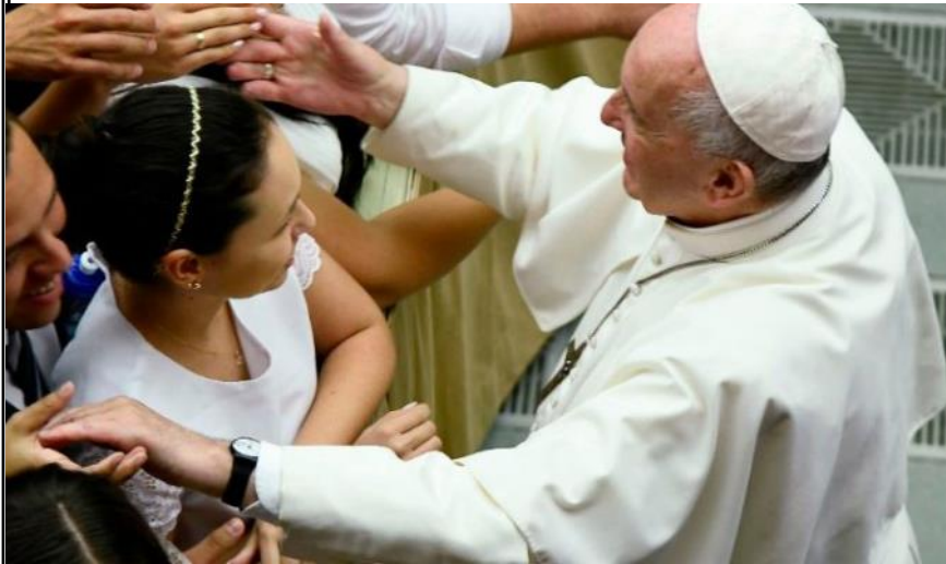
Pope Francis during his weekly General Audience

its origins, “this koinonia, this community, refers first of all to participation in the Body and Blood of Christ.” For this reason, the Pontiff said, “when we receive communion we