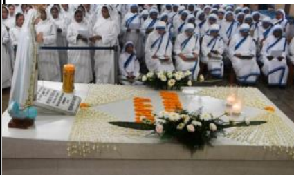
Mother Teresa's 109th birthday being celebrated at her tomb in Kolkata, India, 26 August, 2019.