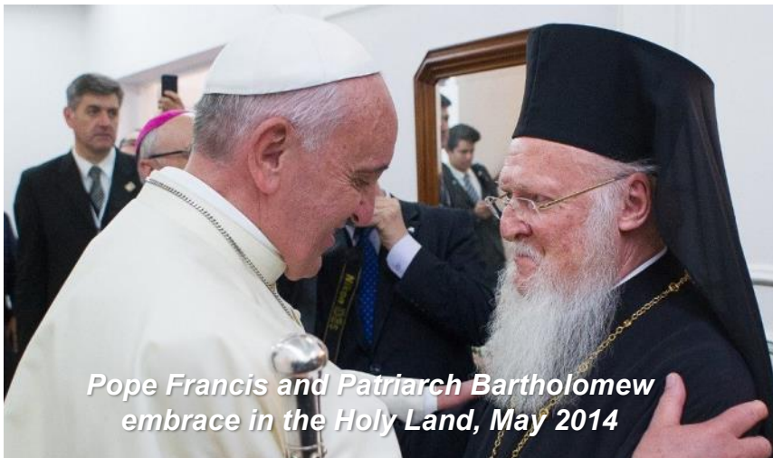
Pope Francis and Patriarch Bartholomew embrace in the Holy Land, May 2014

The letter goes on to explain how, in June 1939, immediately following his election, Pope Pius XII decided to undertake excavations beneath the Vatican Basilica. These works “led first to the discovery of the exact buri-