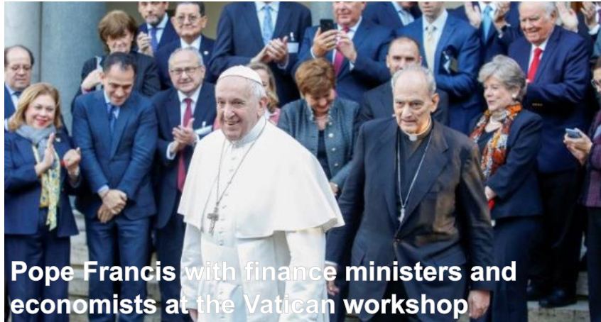
Pope Francis with finance ministers and economists at the Vatican workshop

around us.” Hundreds of millions of people, said the Pope, are struggling in extreme poverty, and are lacking food, housing, healthcare, schooling, electricity, and drinkable water. Around 5 million children will die this year of causes related to poverty, he said.