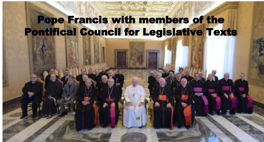
Pope Francis with members of the Pontifical Council for Legislative Texts

Mystical Body of Christ, where the Word of God and the Sacraments are pre-eminent, while the juridical norm has a necessary but subordinate role in the service of communion". He emphasized the importance of helping people understand "the pastoral nature of canon law, its instrumentality with regard to the salus animarum [the