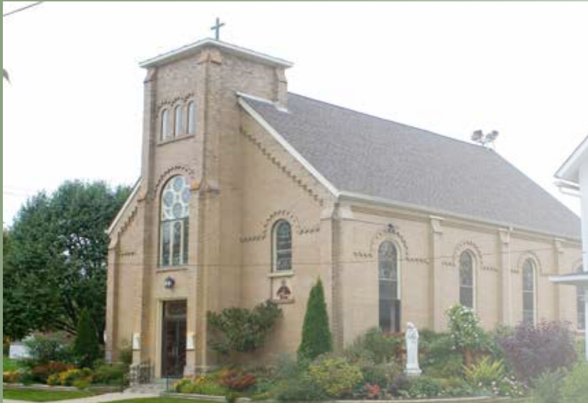
140 West Avenue, Plain City Ohio